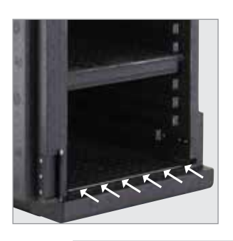
DRIP-RESISTANT Built-in condensation barrier helps front loaders to remain drip-resistant.