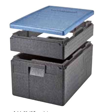
Add 4" (10 cm) to your top loader GoBox to fit oversize items.