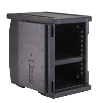
FULL 270° ACCESS Durable hinges allow the door to open 270° and remain open securely to the side of the front loader for easy access to products.