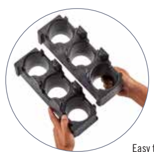
Easy to Assemble.

Modular beverage holder for transporting hot or cold drinks with ease. Interlocking units connect to hold up to 15 drinks in an EPP180. Holds 8 to 32 oz. (236,6 to 946,3 mL) hot or cold cups.