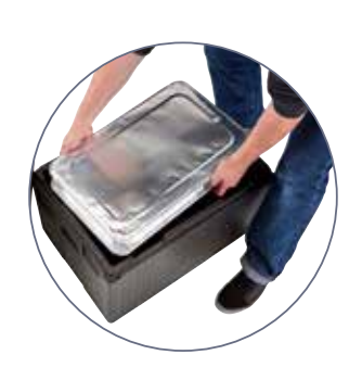
With extra width for easier loading of food pans.